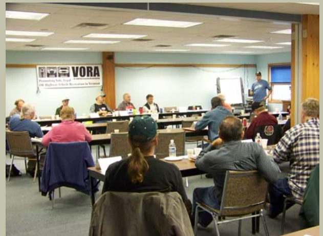
VORA's first annual Meeting

Thank you to everyone who helped VORA become a success during this first year. We have high hopes, and many goals for 2009; check out the VORA website at www.vtvora.org for upcoming meetings.